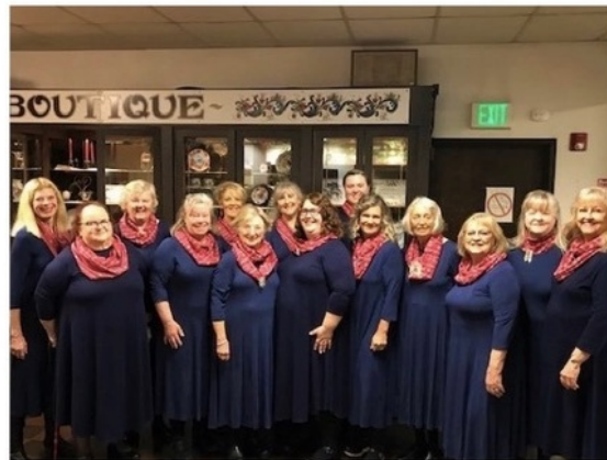
NW NORDIC LADIES CHORUS

Ladies, if you like to sing and would enjoy a variety of Norwegian and Swedish folk, traditional, and classic music, this is the chorus for you!