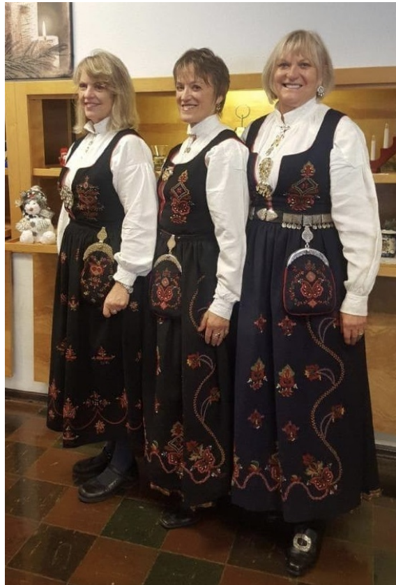
The Molver Sisters