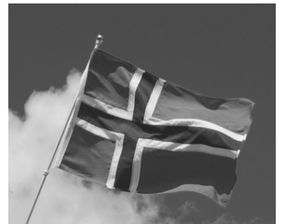
Normanna Lodge is on facebook, just search Normanna Lodge #3 on facebook or google.